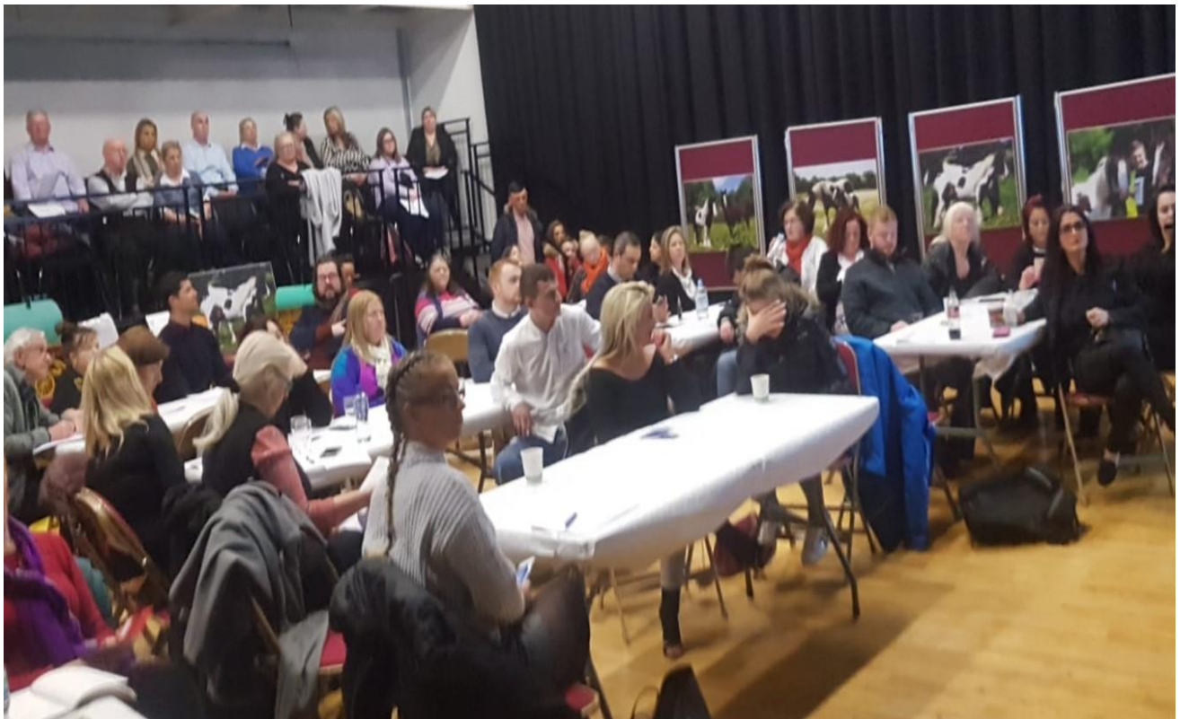
Participants at the Launch of National Traveller Mental Health Network, Galway, 2019

The launch of the National Traveller Mental Health Network, of which the Traveller Counselling Service is a founding member, took place in Galway in February 2019. It was a very successful launch and was very well attended. The NTMHN developed a strategic plan which runs for 2019-2021 (available on request).