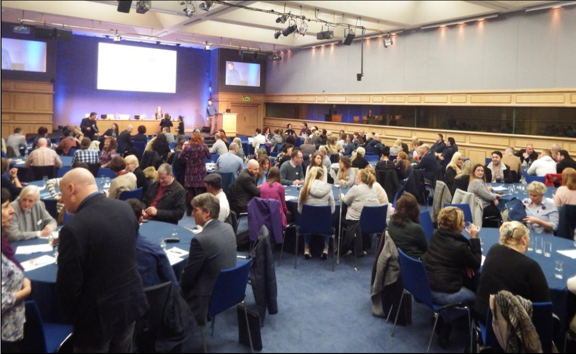
The Impact of Inter-family Conflict on Traveller Mental Health Conference, Dublin Castle, April 2019